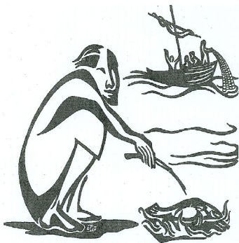
Image and Word: Women Leaders of the Early Church Sunday, January 17, 2010, 2:00 P.M.